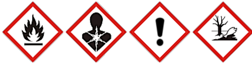
GHS02 GHS08 GHS07 GHS09